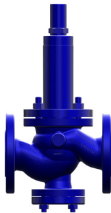
SP 91 Flange connection acc. to DIN EN 1092