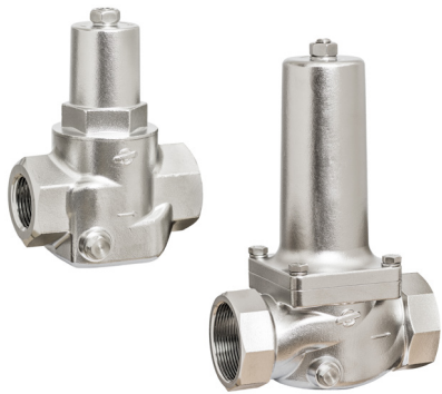
SP 95 Threaded connection acc. to ISO 228