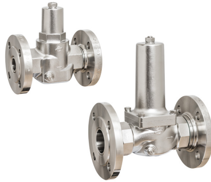
SP 95 Flange connection acc. to DIN EN 1092